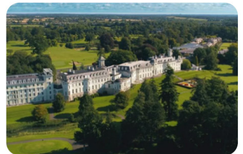
The K Club Co. Kildare

"If we don't bring you value — you simply stop. That's it."