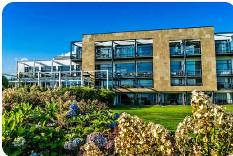
Aghadoe Heights Co. Kerry