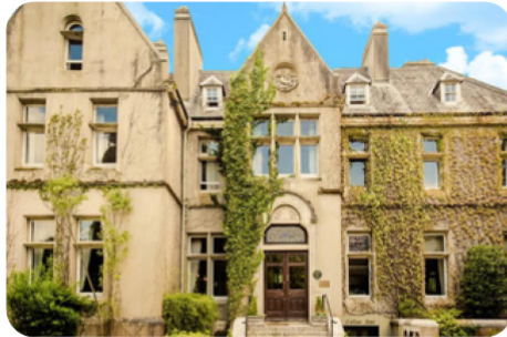
Cahernane House Hotel Co. Kerry

We've been transforming revenue for locations just like yours.