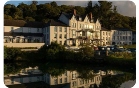
Eccles Hotel & Spa Co. Cork