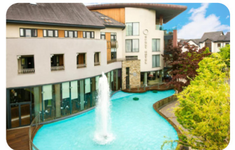
Osprey Hotel Co. Kildare