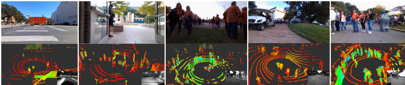
Fig. 2. Five example scenarios from SCAND showing the RGB image and below it the accompanying pointcloud with the monocular image. From left to right, the scenarios have the tags “Street Crossing”, “Narrow Doorway”, “Navigating Large Crowds”, “Vehicle Interaction”, and “Crossing Stationary Queue.”