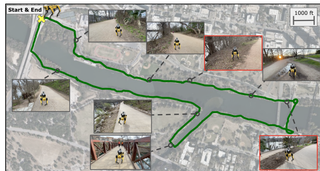
Fig. 5. A large-scale qualitative evaluation of STERLING on a 3-mile outdoor trail. STERLING features successfully complete the trail with only two manual interventions (shown in red).

In this dissertation, we address the crucial challenge of aligning robot navigation objectives with human intentions and preferences in unstructured environments, by presenting three novel contributions. First, we introduced VOILA, a visual imitation learning algorithm that adeptly overcomes the common egocentric viewpoint mismatch problem. By leveraging a unique reward function, it successfully imitates, on a mobile robot, navigation demonstrations from physically different