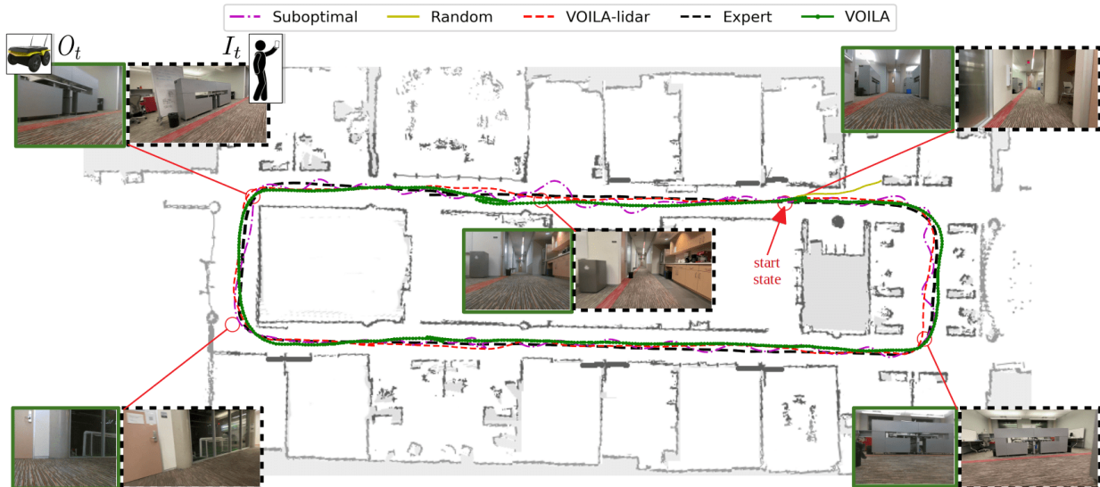
Fig. 1. Policy rollout trajectories of the VOILA agent (green) successfully imitating a demonstrated behavior (black) of patrolling a rectangular hallway clockwise. The demonstration consists of a video gathered by a human walking while using a handheld camera that is considerably higher than the robot’s camera (introducing significant viewpoint mismatch). We see that the VOILA agent is able to successfully imitate the expert demonstration even in the presence of this egocentric viewpoint mismatch.

supervised terrain representation learning approach that learns terrain representations through multi-modal self-supervision from easy-to-collect unconstrained robot experience. In summary, this dissertation presents two novel algorithms and a large-scale dataset that enable mobile robots to navigate in unstructured indoor and outdoor environments in accordance with human intentions and preferences.