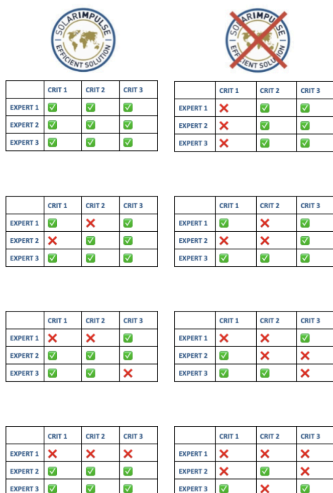
Figure 3: Examples of potential outcomes (Labeled or rejected) based on experts' evaluation. E1: Expert 1, E2: Expert 2, E3: Expert 3.

The grant date of the Solar Impulse Efficient Solution Label corresponds to the date of the final internal review. Both positive and negative outcomes are communicated to