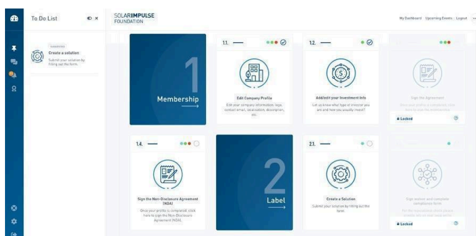
Figure 2: Applicant's (member) Dashboard

As a first step, the Applicant is required to become a member of the World Alliance For Efficient Solutions. This step requires them to log into the Website and create a member innovator profile by completing the company profile and signing the Membership Agreement. By signing the Membership Agreement, members commit to the Charter, Statutes, and Core Values of the World Alliance. Once the profile is created, the SIF Team checks and validates the member profile. The applicant then has access to the member Dashboard, which allows them to manage the application as well as other features linked to their profile.