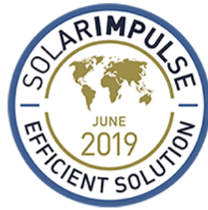
Figure 5: Example of a logo with the month and year of Labeling.