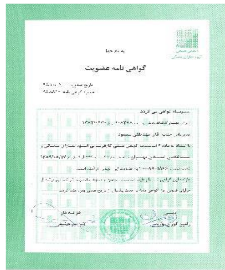
Membership of Mass Developers' Association, Behsaz Kashaneh Tehran Company