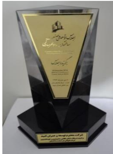
Winner of Property Development Competition, Omid Construction & Development Company