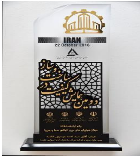
Crystalline Statuette of Construction Quality, Roya Arya Construction Company