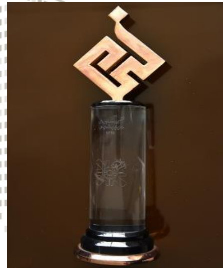
Crystalline Statuette of Project Management, Roya Arya Construction Company