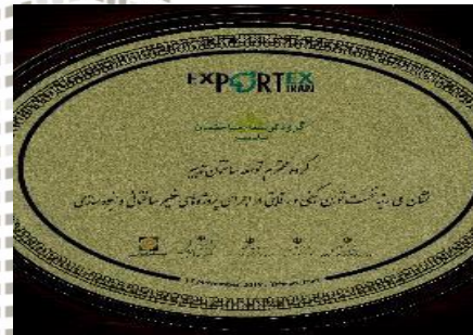
Top National Award of Quality Capability, Tadbir Construction & Development Group