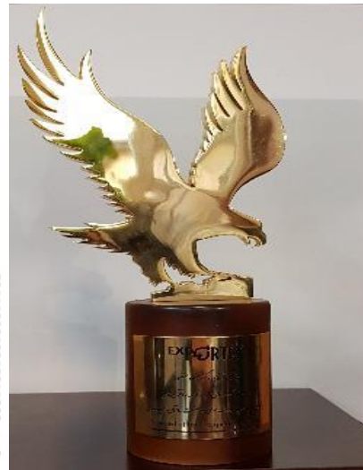
Statuette of Successful Management of Construction Industry, Tadbir Construction & Development Group