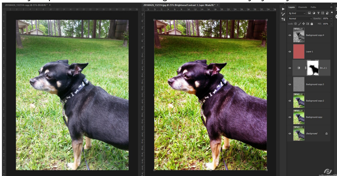
Photo actions are great, but, not all actions are created equal.

It was really simple and I had a lot of fun doing it! Here's a look at my layers if you're interested: