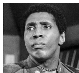
Herb Jefferson Battlestar Galactica – Lt. Boomer Galactica 1980 – Col. Boomer