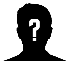
TOS Main Cast Guest Star Trek: The Original Series