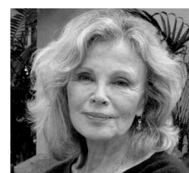
Marta Kristen Kane Lost in Space – Judy Robinson Battle Beyond the Stars – Lux

Rachel Luttrell and David Hewlett will sign one FREE autograph on Saturday and Sunday for each attendee.