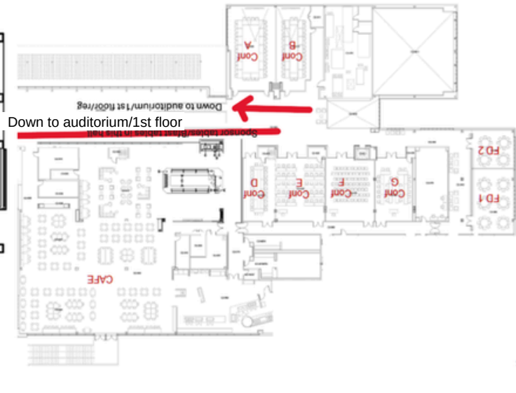
Map of conference space