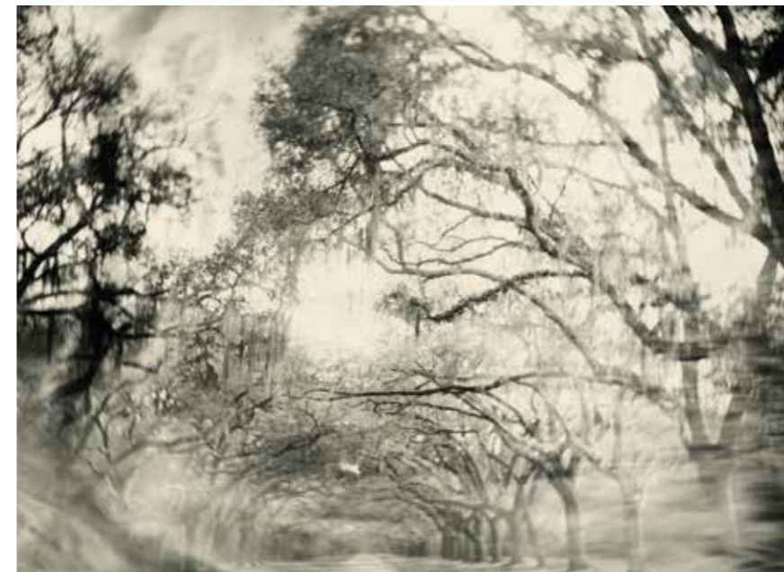
Below 'Georgia, Untitled (Allee)' by Sally Mann HonFRPS