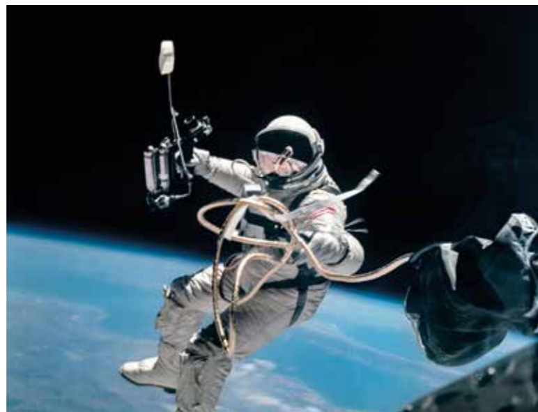
Below 'Ed White floats in the void during the first US spacewalk on Gemini 4 on June 3, 1965'