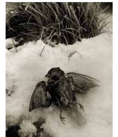
'A winter's victim' by Don McCullin HonFRPS

In the year of the Honorary Fellow's 90th birthday comes this collection of poetic still lifes and landscapes. Unpublished, though spanning decades in the making, the images speak to McCullin's sensitive observation of the currents that animate our world.