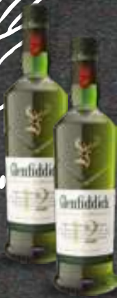
GLENFIDDICH 12 Y.O