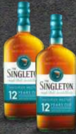
SINGLETON 12 Y.O