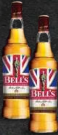
BELL'S ORIGINAL - WHISKY