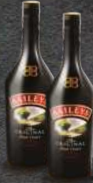
BAILEYS IRISH CREAM