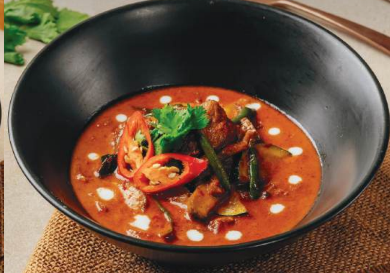
แกง To SHARE Penang Curry