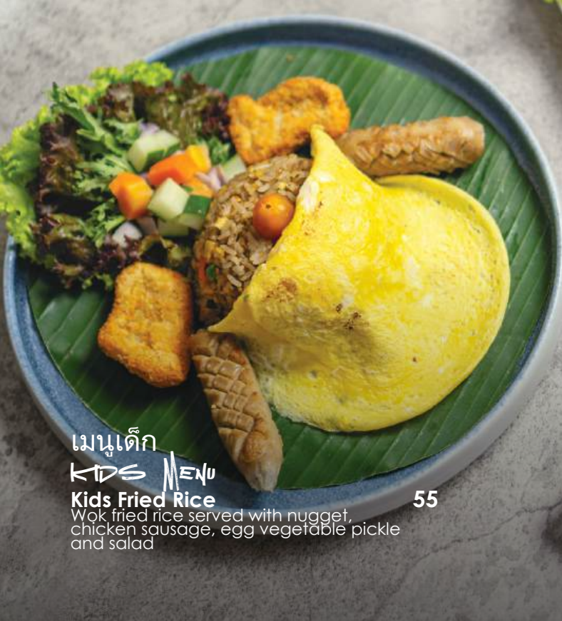
เมนูเด็ก KIDS MENU Kids Fried Rice Wok fried rice served with nugget, chicken sausage, egg vegetable pickle and salad