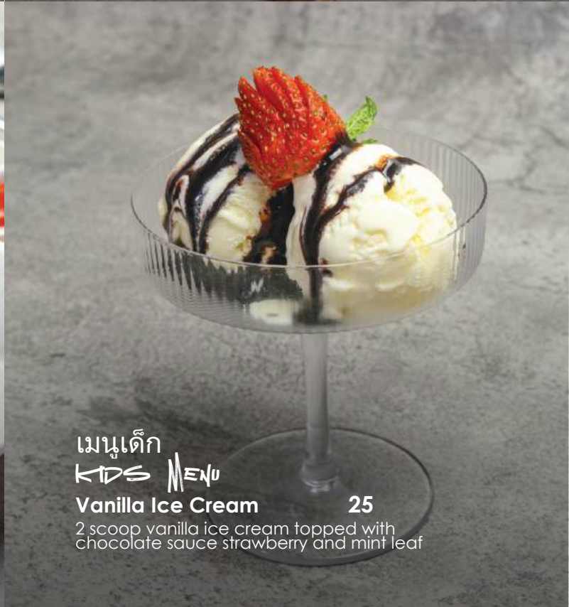
เมนูเด็ก KIDS MENU Vanilla Ice Cream 2 scoop vanilla ice cream topped with chocolate sauce strawberry and mint leaf