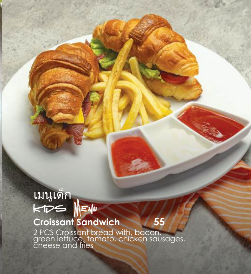
เมนูเด็ก KIDS MENU Croissant Sandwich 2 PCS Croissant bread with, bacon, green lettuce, tomato, chicken sausages, cheese and fries