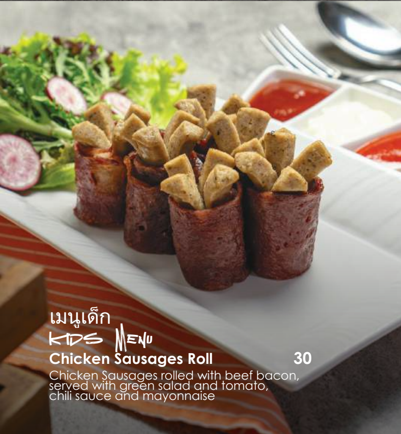
เมนูเด็ก KIDS MENU Chicken Sausages Roll Chicken Sausages rolled with beef bacon, served with green salad and tomato, chili sauce and mayonnaise