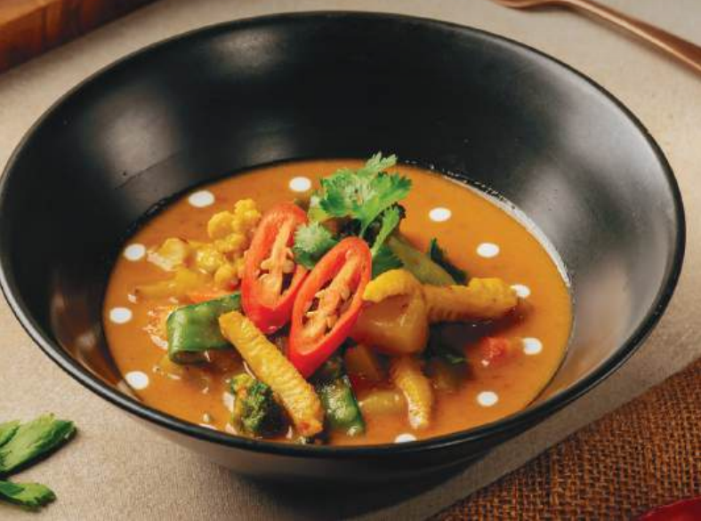
แกง To SHARE Red Curry