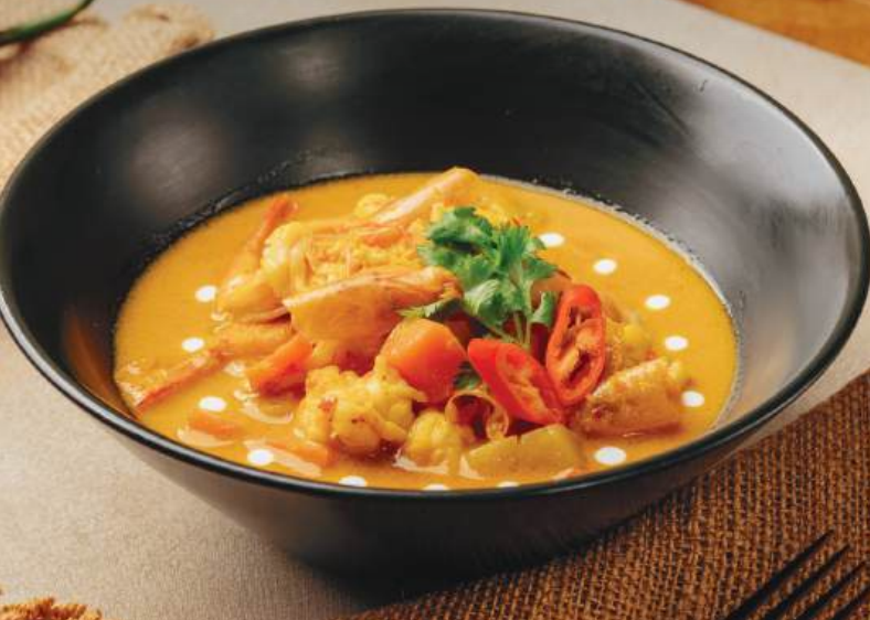
แกง To SHARE Yellow Curry