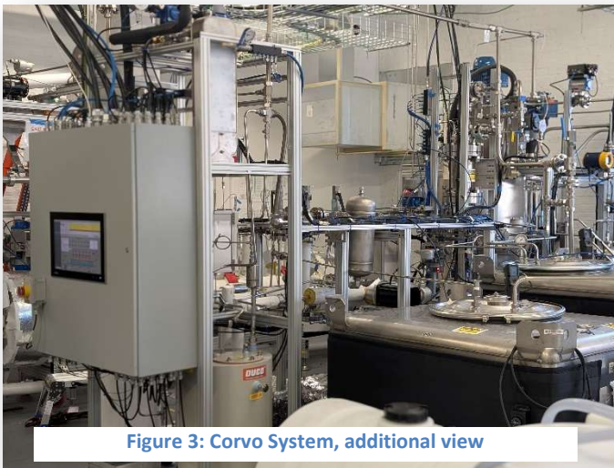
Figure 3: Corvo System, additional view

Ignition-based touchscreen HMI screens were developed to support startup, normal operation, monitoring, and troubleshooting. The HMI emphasized visibility into process state and sequencing to support experimental testing, diagnostics, and rapid adjustment during pilot operation.