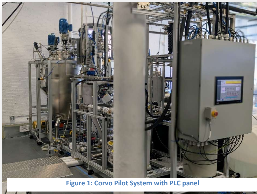
Figure 1: Corvo Pilot System with PLC panel

The resulting pilot control system provided Found Energy with a stable platform for experimentation and validation, while intentionally preserving flexibility to support future process changes, subsystem additions, and scale-up exploration.