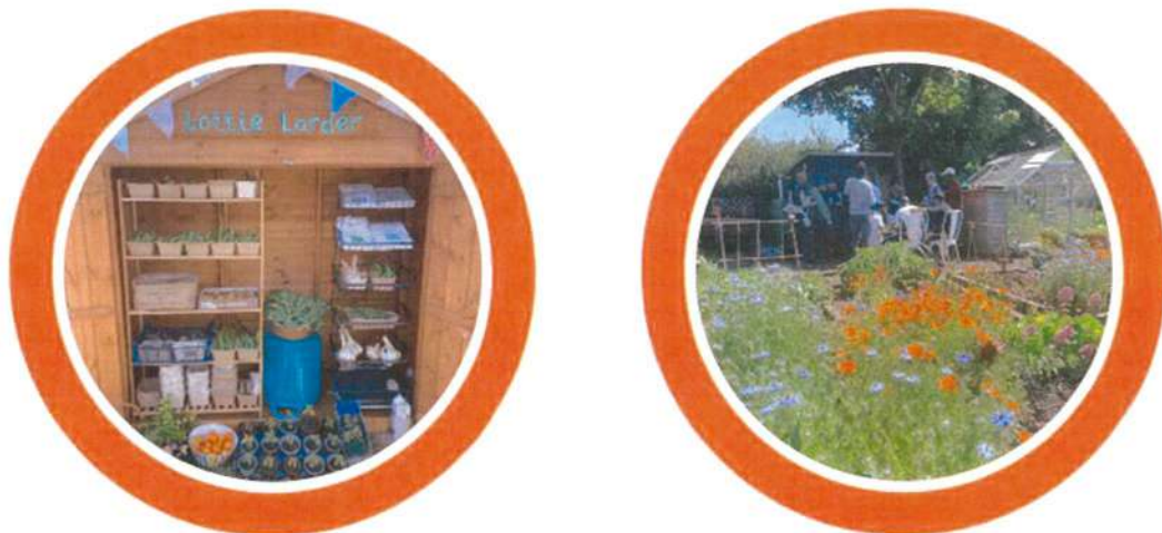
Community Allotment and Larder. Portland, Dorset, UK.