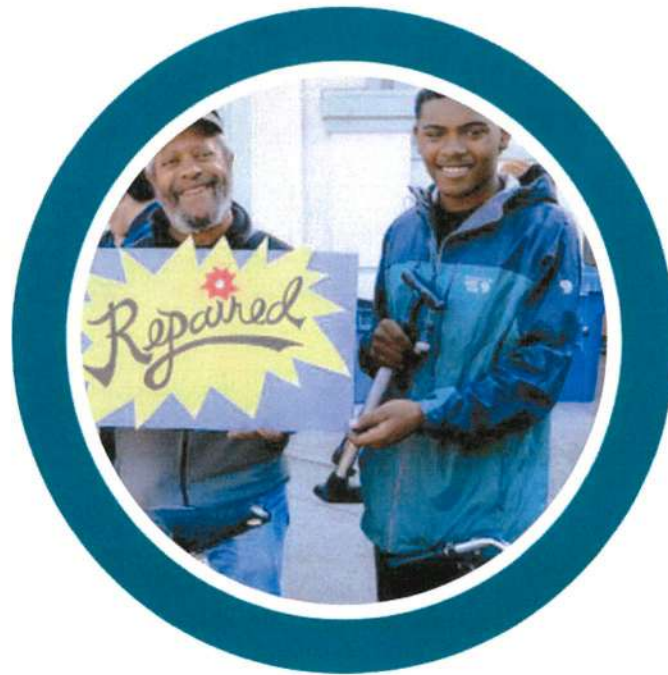
Transition Berkeley, US, Repair Cafe.