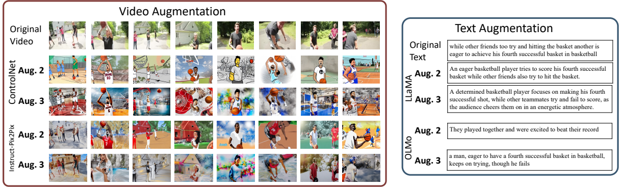
Figure 4: Qualitative examples of data generated by DREAM. “Aug. 2” and “Aug. 3” refer to augmentation by text paraphrasing and video stylization and augmentation by relevance enhancing.